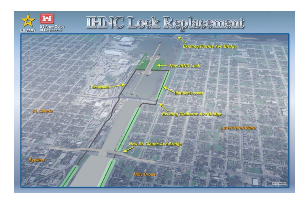
Figure 1-4. Location of the Existing and (Proposed) Future Lock